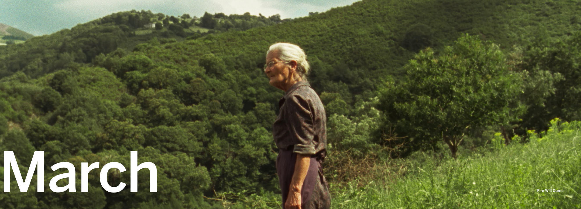
Fire Will Come